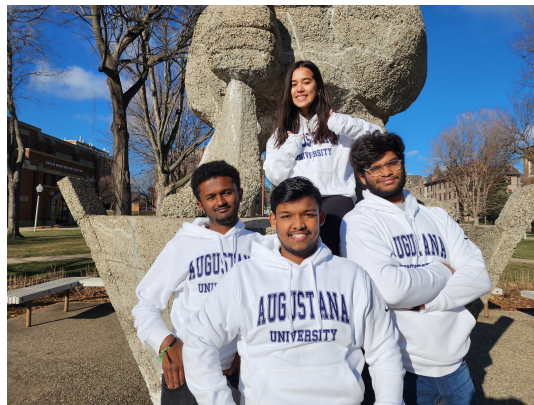
GardenMate team wins 2022 Call for Code Global Challenge

ARMONK, N.Y., Dec. 6, 2022 /PRNewswire/ -- Today, Call for Code founding partner IBM (NYSE: IBM ), creator, David Clark Cause , charitable partner United Nations Human Rights , and program affiliate, the Linux Foundation announced the winner of the fifth annual Call for Code Global Challenge, which invited innovators across the globe to help accelerate sustainability and combat climate change with open source-powered technology. The top prize this year went to GardenMate for creating an app that uses IBM Watson® to connect gardeners with excess produce to people in need.